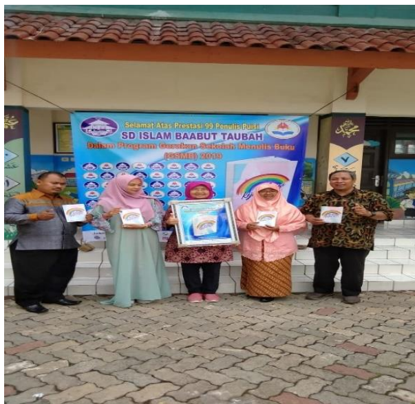
Figure 1: Launching of the Rainbow Honesty Anthology book

Time keeps turning. This school literacy activity helps the development of the school as an active school of literacy. Eventually, it becomes a new culture in the teacher school. One of the teacher moves supported by the school is to require that each generation of children who graduate must make a book, either a solo work or an anthology. This breakthrough has been going on for the 3 rd year and has produced various bookworks at the teacher's school.