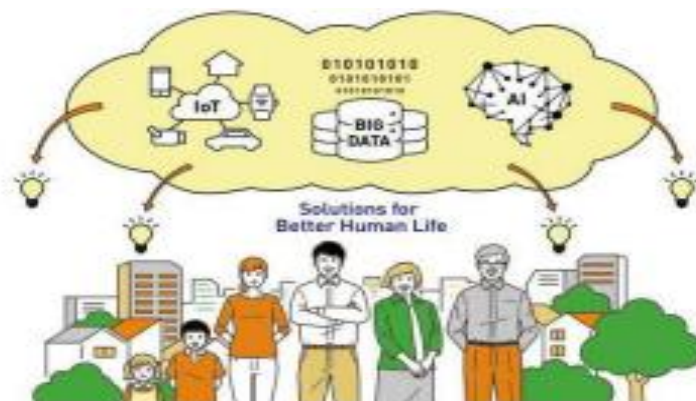
Figure 2: Illustration of Society 5.0 (Government of Japan, 2018)

also solves social problems by integrating physical and virtual space (SKobelev & Borovik, 2017).